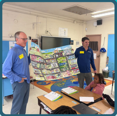
Thank you to Fulton Bank for volunteering at Oceanair Elementary School in Norfolk!