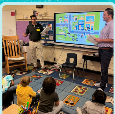
Thank you to Cherry Bekaert for volunteering at Oceanair Elementary School in Norfolk!