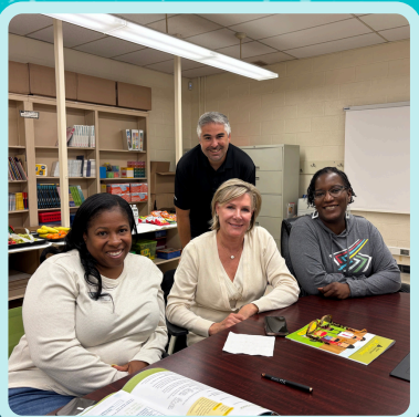
Volunteers from Atlantic Union Bank, Dollar Bank, and Capital One at Chesterfield Academy in Norfolk!